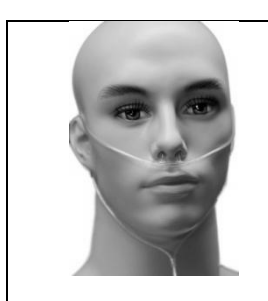
Place cannula in nose, around ears and under chin

Note: Never force the threads between the cup / head interface. If the threads are not lined up properly the inhaler will not function correctly. If this occurs, SLOWLY unscrew the cylinder in small increments. If the cylinder is punctured, you will hear a hissing sound. Stop: Do not unscrew further until all gas is released (when hissing noise stops). When all gas has escaped, replace with new cylinder and start again. Do not touch the used cylinder. Discard directly into garbage (see Removing Gas Cylinder below).